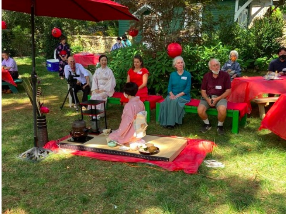
We performed Green Tea Ceremony at Savage Garden. We are making Green Tea initiative program for who want to learn.