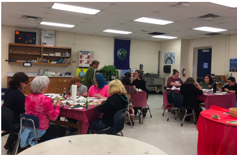
We taught how to make Sushi at South Doyle Middle school.