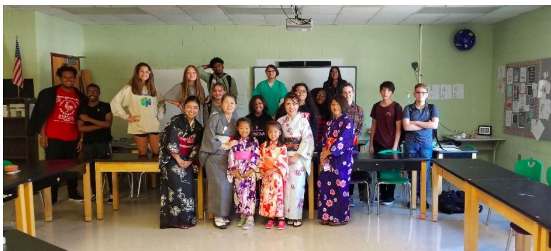
We performed Green Tea Ceremony for Bearden High School Japan Club.