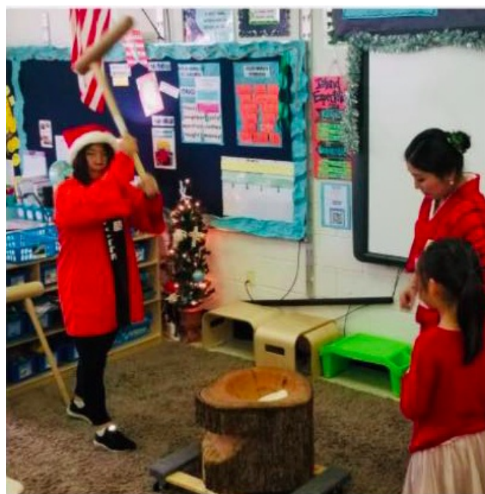
We perform the Sweet Rice pounding ceremony.