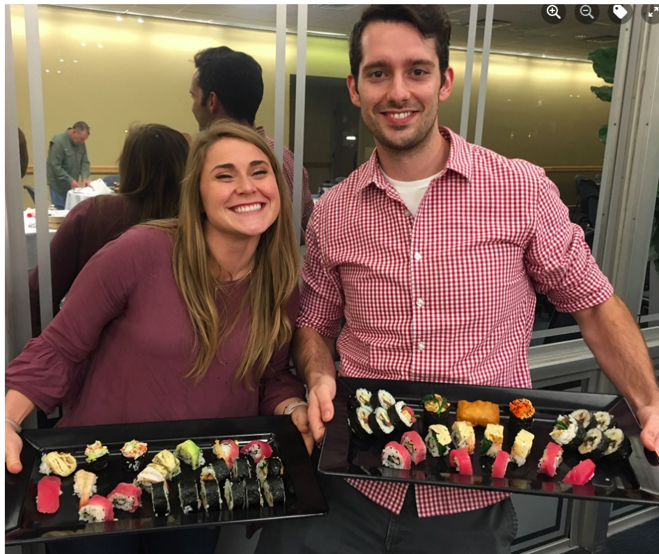
Dec 7th 2021 We will have a sushi class at University of TN.