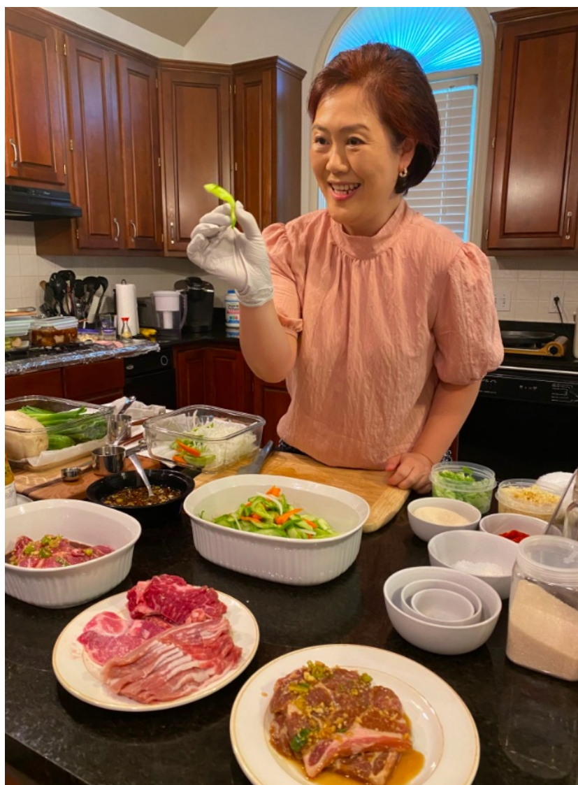
Dr.Hyunju taught how to make Kimchi online.