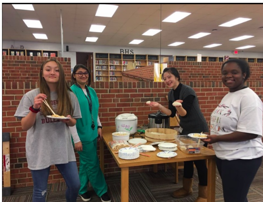
Bearden High School Japan Club. Mochi making.