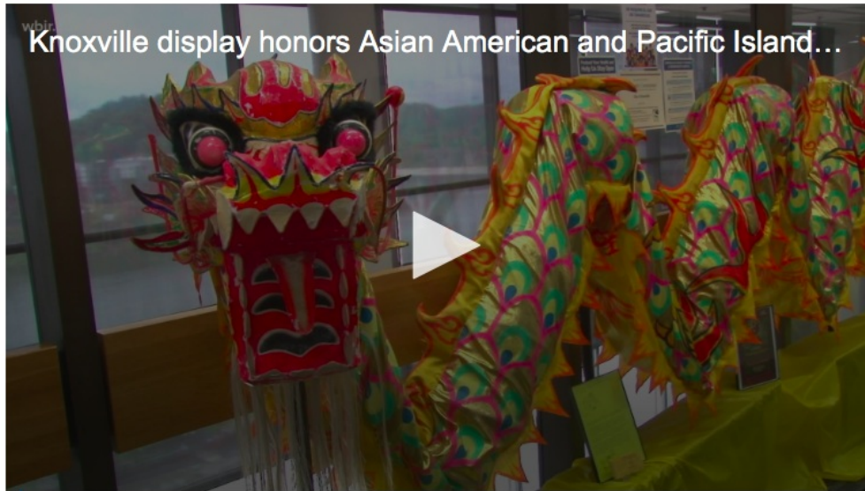
Asian country clothing display at Knox County Office.