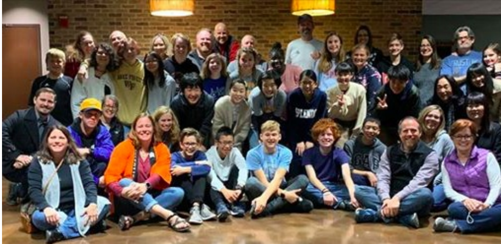
Cedar Bluff Middle hosts Japanese sister city visitors